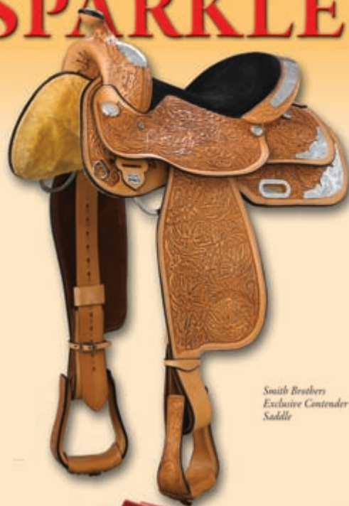
Smith Brothers Exclusive Contender Saddle